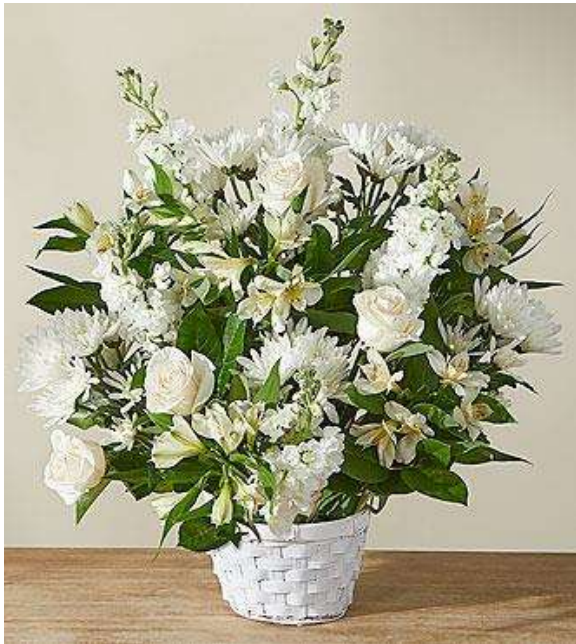
Stepgrand daughters and family